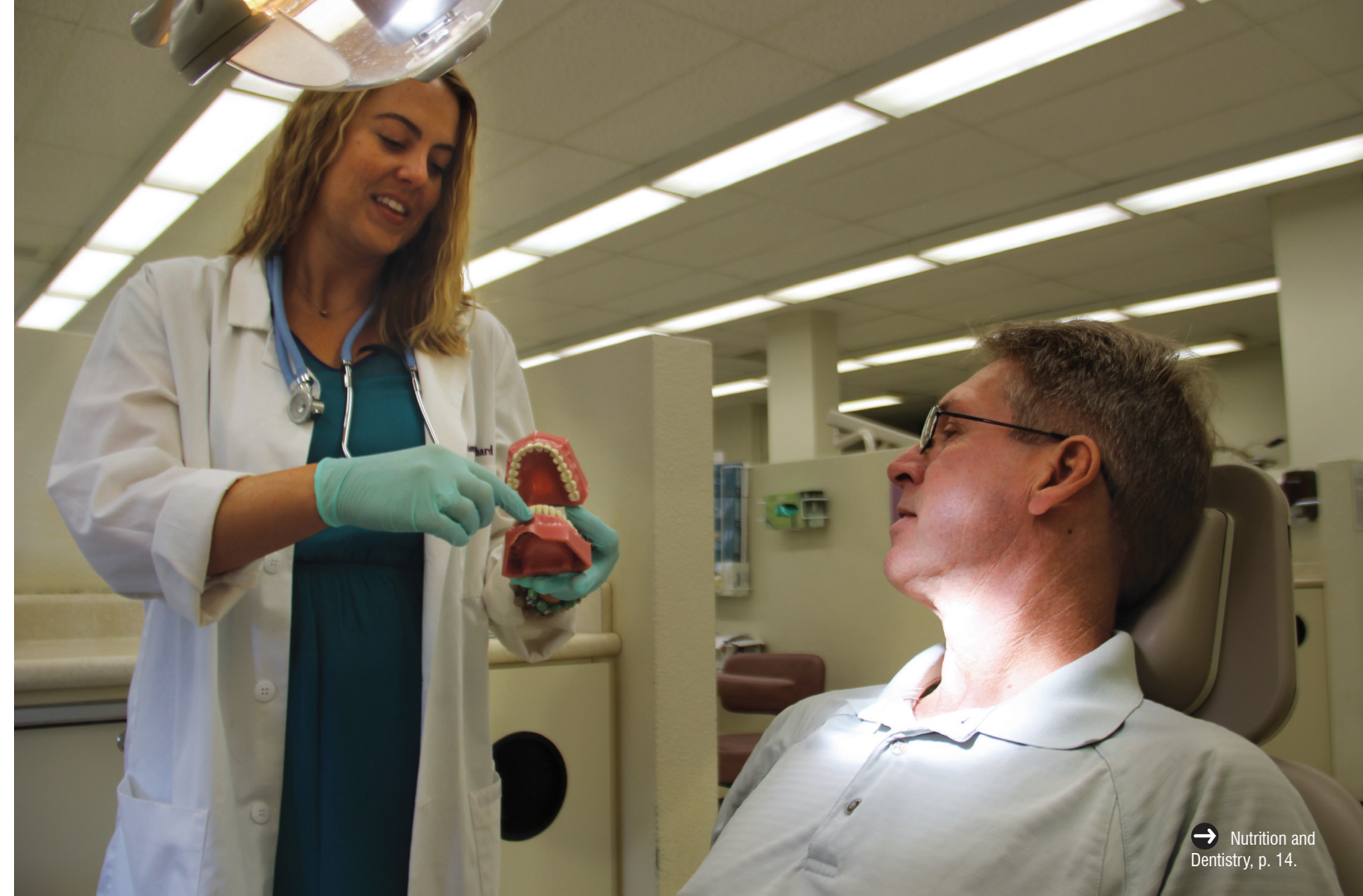
➔ Nutrition and Dentistry, p. 14.