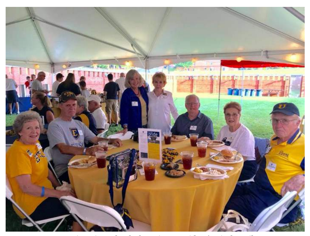
University School Alumni at President's Circle Tailgate