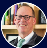
Dr. Paul Farmer

"To Repair the World: Dr. Farmer Speaks to the Next Generation"