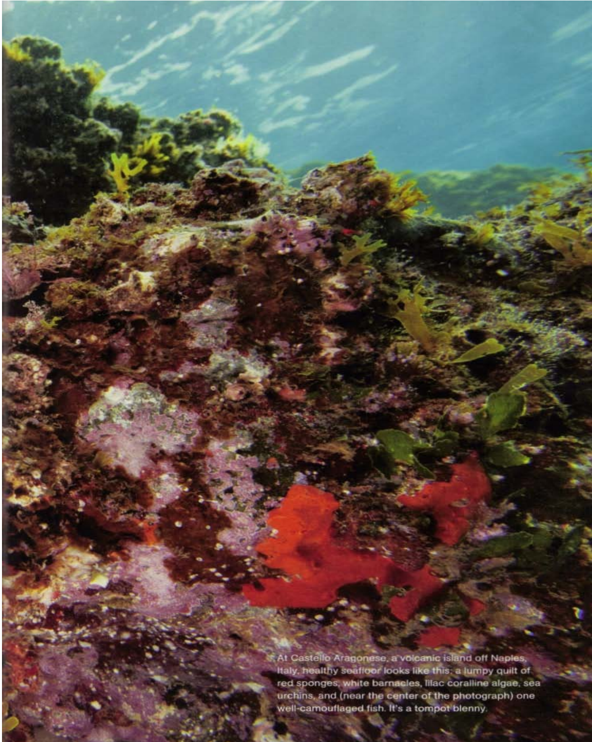
At Castello Aragonese, a volcanic island off Naples, Italy, healthy seafloor looks like this: a lumpy quilt of red sponges, white barnacles, lilac coralline algae, sea urchins, and (near the center of the photograph) one well-camouflaged fish. It's a tompot blenny.

The carbon dioxide we pump into the air is seeping into the oceans and slowly acidifying them. One hundred years from now, will oysters, mussels, and coral reefs survive?